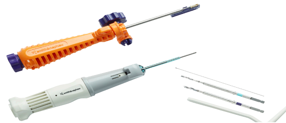
ULTRABRACE ◇ Kit

FOOTPRINT ◇ ULTRA PK TWINFIX ◇ ULTRA PK Q-FIX ◇ with Needles ULTRABRIDGE ◇ kit ULTRABRACE ◇ kit HEALICOIL ◇ PK suture anchor with needles FOOTPRINT ◇ MINI PK